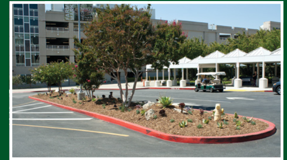
After: By converting from thirsty turf to a sustainable Design/Build solution, Kaiser Permanente will realize a significant return on its investment, with diminished maintenance costs and as much as a 90 percent reduction of its landscape irrigation costs.

Stay Green Inc. approaches every project with sustainability in mind. For example, in a typical turf replacement project we'll utilize the old turf as fertilizer and retrofit the irrigation system to upgrade it to modern drip technology. We strive to reduce waste while creating beautiful landscapes – so our clients don't have to compromise between beauty and efficiency. Stay Green Landscape Design/Build Services creates and constructs intelligent landscape designs that offer stunning beauty and efficient use of your resources – both financial and natural!