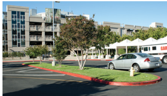
Before: Kaiser Permanente, Panorama City Parking Median Turf Conversion Phase I

Stay Green Inc.'s Design/Build Services offer complete project delivery, from inception through design and construction. Integrated Design/Build Services deliver a positive return on your landscaping investment, whether the project is starting from scratch or a redesign of an existing landscape. Stay Green's Design/Build team can transform your landscape, making it more sustainable, efficient and cost-effective.